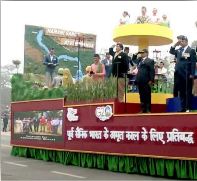
Atulya Ganga People Participation Highlighted on RD Parade 2023