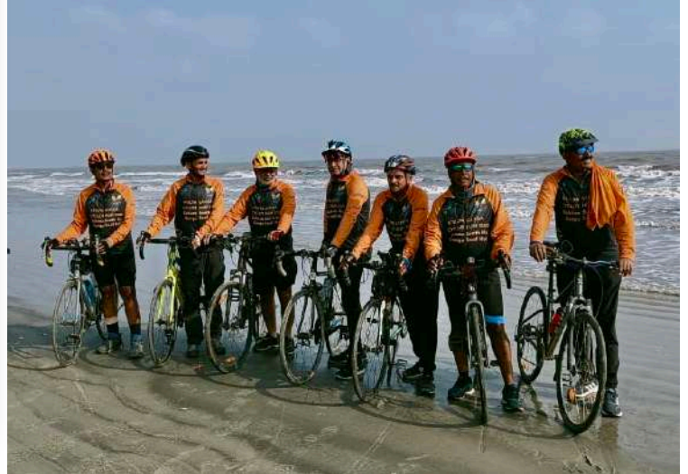
Ganga Cyclothon 2022