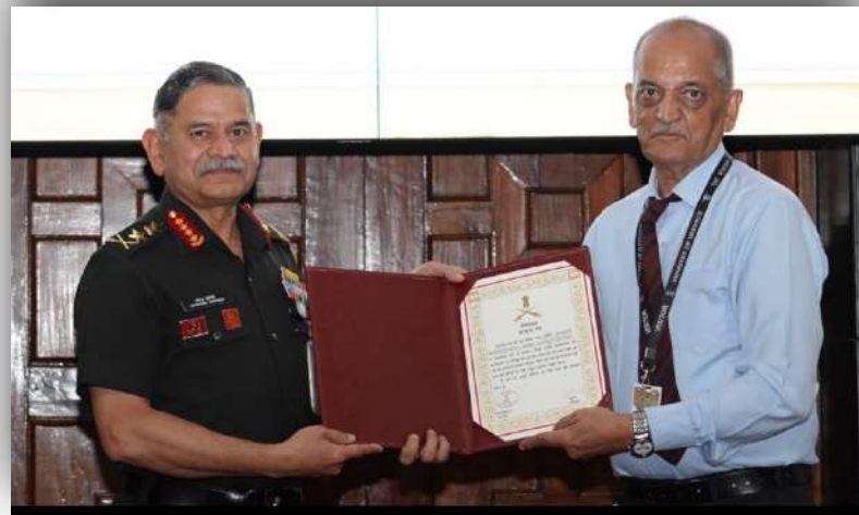
Chief of Army Staff Commendation 20224