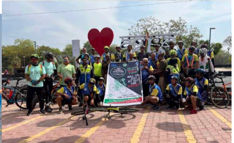
Yamuna Cyclothon 2023