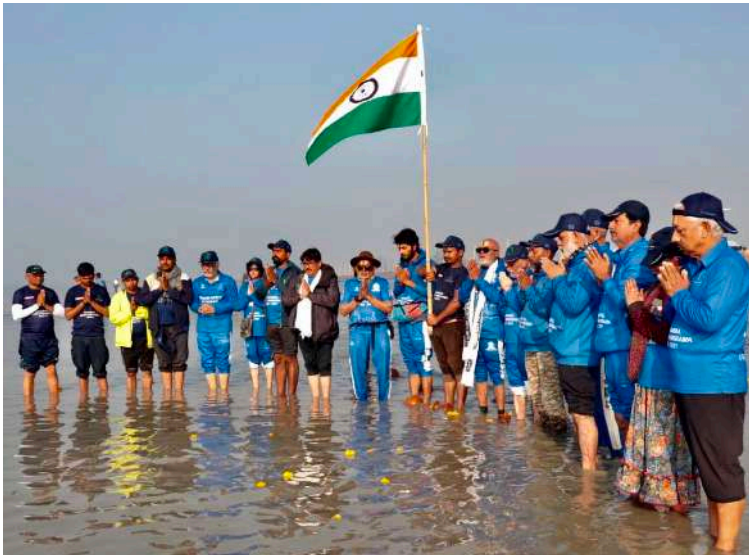
Atulya Ganga Walkathon 2020-21