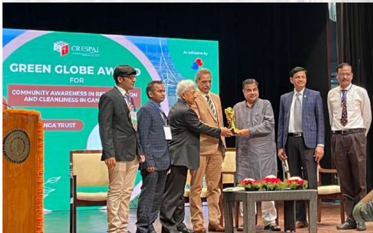
Atulya Ganga Gets Green Globe Award